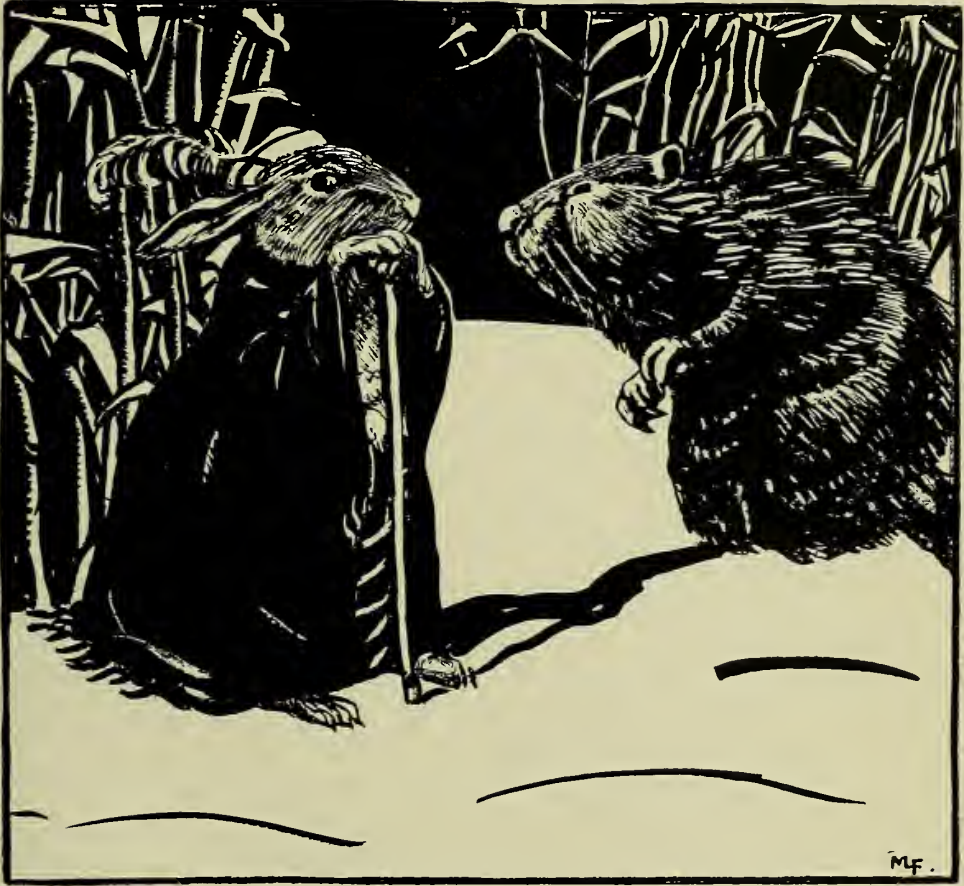
HE WENT TO BEAVER'S HOUSE BY THE STREAM, HOBBLING ALONG WITH A STICK